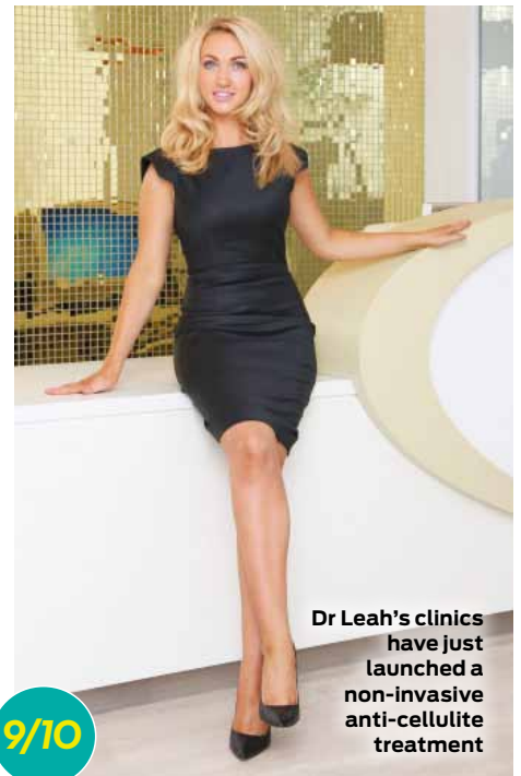
Dr Leah's clinics have just launched a non-invasive anti-cellulite treatment

VERDICT: The difference around the thigh area worked wonders for my confidence. Some people say the treatment can be uncomfortable, but I barely felt a thing. And to be honest, tolerating mild discomfort for an hour is worth losing ten inches of fat and cellulite! FOR MORE DETAILS: Go to www.drleah.co.uk and www.3d-lipolite.co.uk .